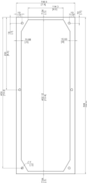
click image to enlarge